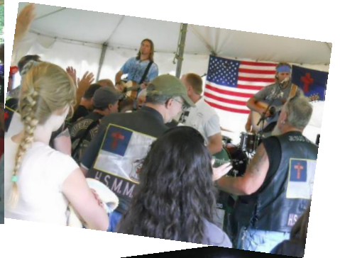
Great Services under the Tent (Thanks to Lord's Disciples of Maryville, TN for the tent)