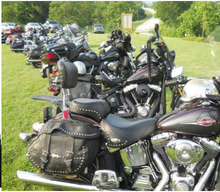
Lots of Bikes