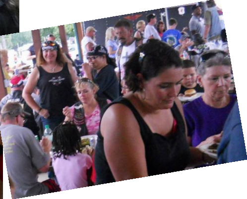
An Abundance of Food & Fellowship