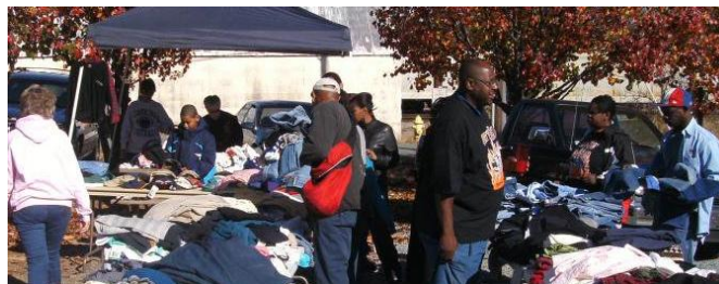
Clothing for the Homeless