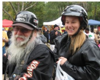
Riding in the Sunland Fall Festival Parade Marianna, Fl

Many of our members are involved in personal ministry projects which are going well. This includes the HWBC (Heaven's Way Biker Church). Awesome way to reach those who would not darken the door of a traditional church. In the